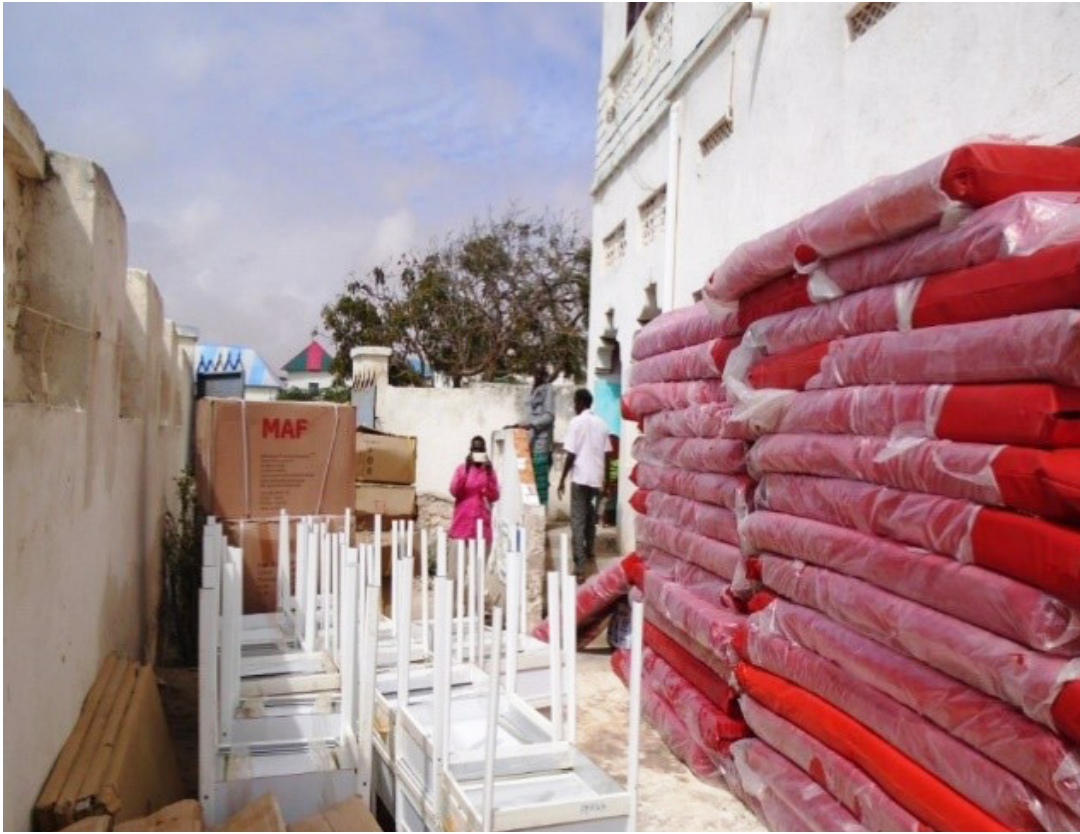
Delivery of hospital requirements at Ayuub community health centre, Marka