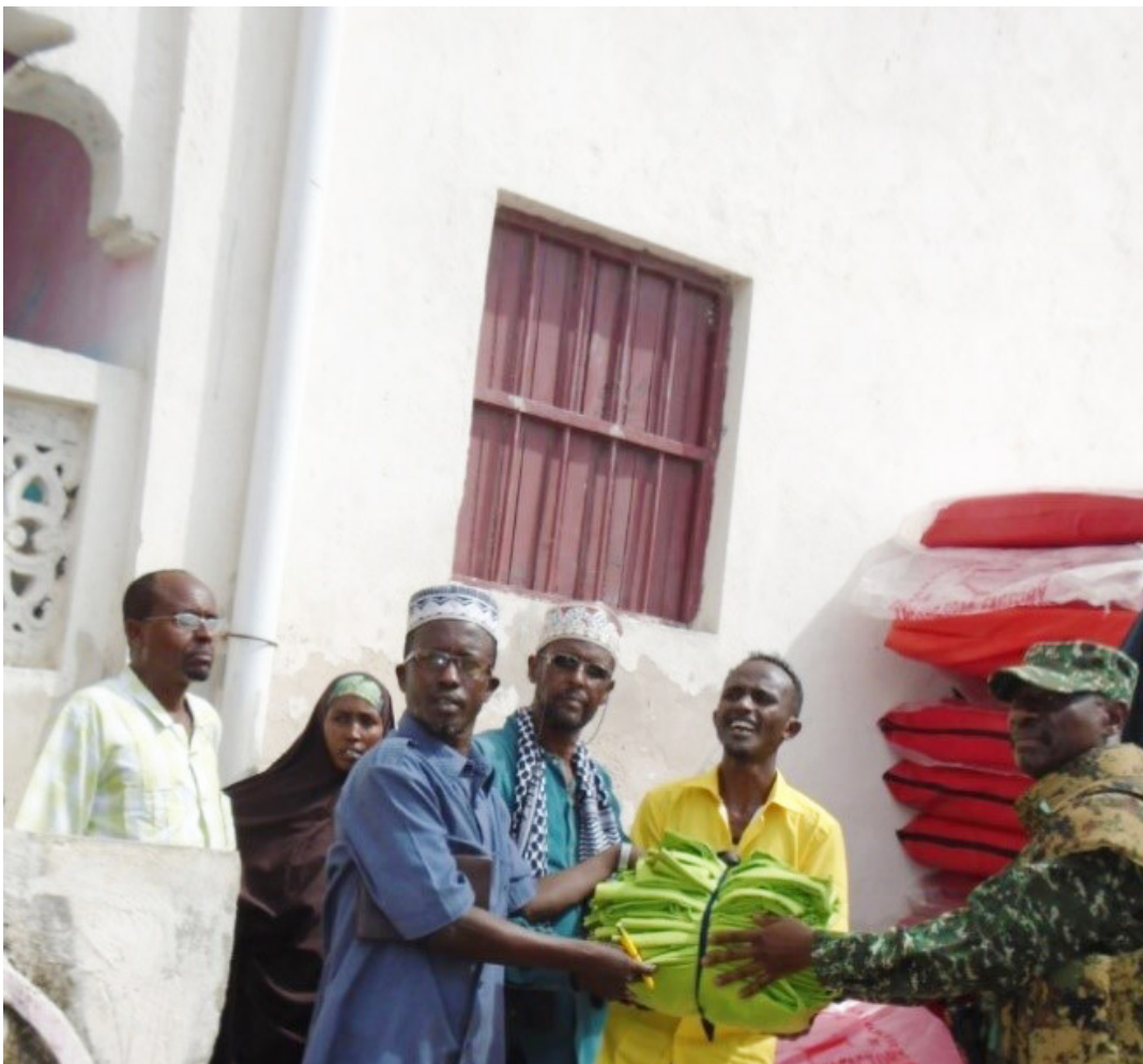
Handover of hospital requirements by AMISOM to health centre administrators and community leaders in Marka