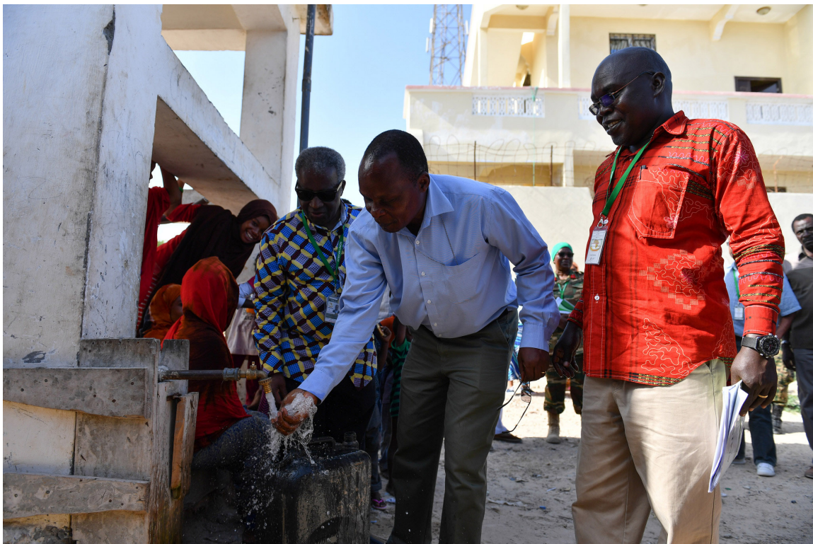
Water Project for the Outpatient Department (OPD) community near AMISOM Base Camp