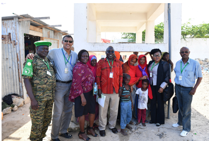
Photo showing the evaluation team with community members