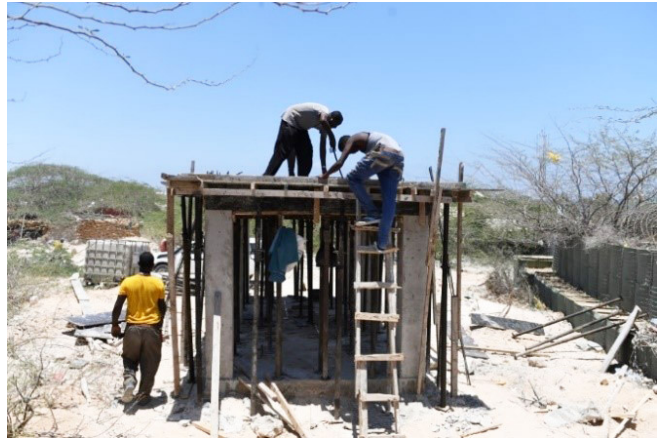
Photos showing the first platform of the water storage facility during construction