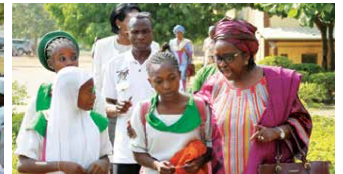
AU Special on Women, Peace and Security with school girls in Nigeria