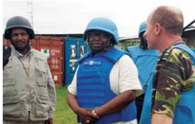
Special Envoy in Nasir, South Sudan with UNMISS Peacekeepers and IGAD Monitors

In March 2014, the Special Envoy was appointed as one of five members of the Commission of Inquiry on South Sudan, mandated by the Peace and Security Council to investigate the genesis of the conflict that was tearing apart the newly established Republic of South Sudan and to unveil the human rights violations committed during the crisis, with the aim of making recommendations on ways to address the crisis and to rebuild the country.