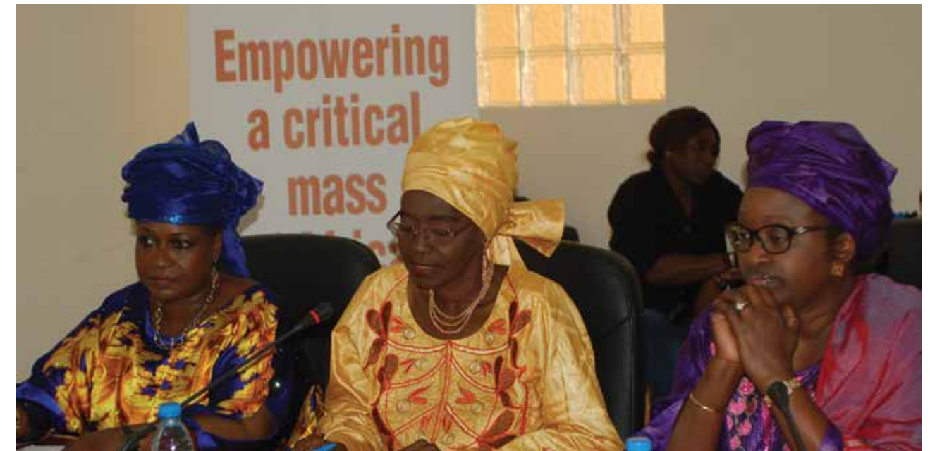
Women in Electoral Mediation Training

The OSE encourages the creation of women's networks for peace. It believes that when women join forces around a single or common agenda and work together – in this case for the peace agenda – the results and impact have a positive multiplier effect on society.