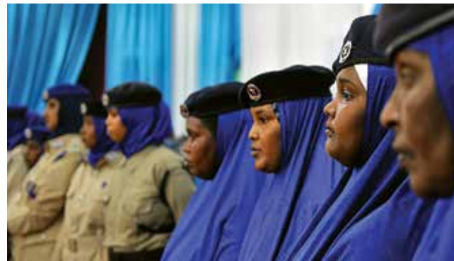
Somalia: Police training

Troop and police contributing countries and organizations involved in peacekeeping and