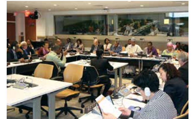
High-Level Panel on the margins of UNSC, New York, October, 2015. Launch of booklet: "The African Union: 15 Years of the Women, Peace and Security Agenda in Africa: Stocktaking and Perspectives". Organised by the OSE, OSAA and UN Women