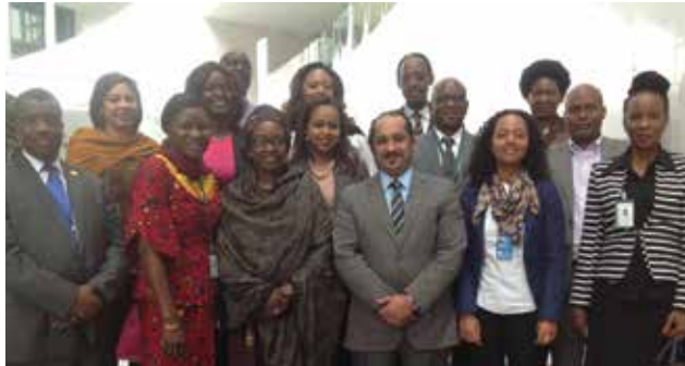
Consultation with colleagues from the AU Peace and Security Department, Women, Gender and Development Directorate and Bureau of the Chairperson, on synergy and implementation of the WPS agenda in Africa

The Office of the Special Envoy works in collaboration with the Peace and Security Department, the Women Gender and Development Directorate, the Bureau of the Chairperson and other stakeholders who are critical in advancing the women, peace and security agenda in Africa.