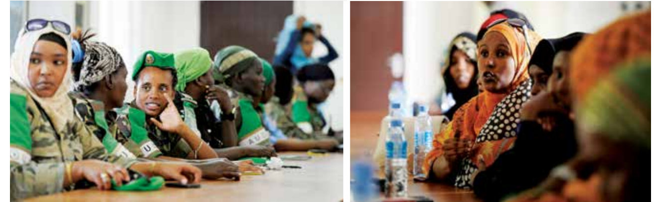
Members of Somali Women NGOs

In November 2014, the Special Envoy undertook a solidarity mission to Somalia to convey support to the women of Somalia, advocate for their needs at the highest levels, and reiterate the necessity to prioritise women's active participation in the rebuilding of the country.