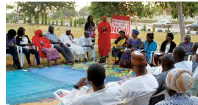
Consultation with "Bring back our Girls" Campaign Members

In December 2014, the Special Envoy travelled to Nigeria in solidarity with women and families affected by Boko Haram. She echoed the voices of the women of Nigeria in their efforts to end all gender-based violence, and in particular the suffering of the Chibok school girls.