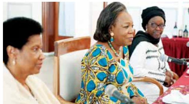
Joint AU/UN Women Solidarity Mission to the Central African Republic – May 2014: Centre - President of CAR, Catherine Samba-Panza; left - UN Women Executive Director, Phumzile Mlambo-Ngcuka; right - AU Special Envoy, Women, Peace and Security, Bineta Diop

In October 2015, the Special Envoy was back in CAR to support a training of women's groups in peace building and participation in the upcoming election.