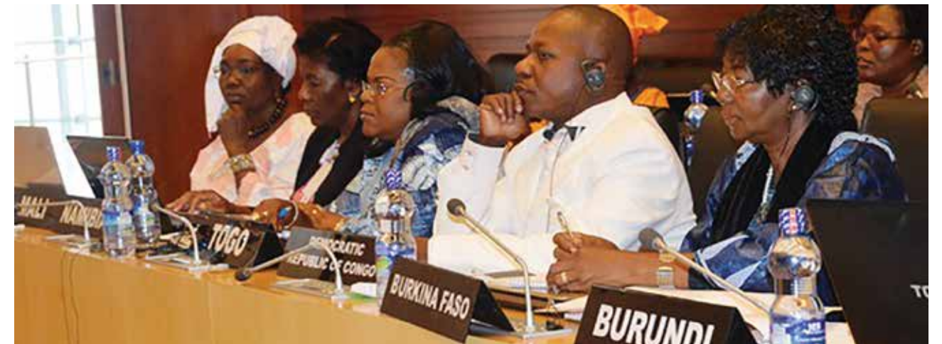
Consultative meeting with AU Member States that have developed NAPs for the implementation of UNSCR 1325, Addis Ababa, December 2015